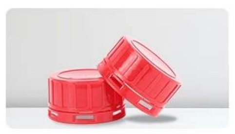
100% PP material