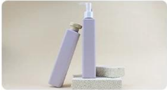
100% Improve brand expanding