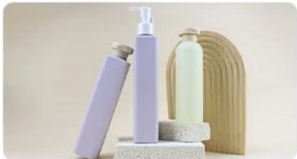
100% HDPE material