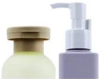
100% No leaking