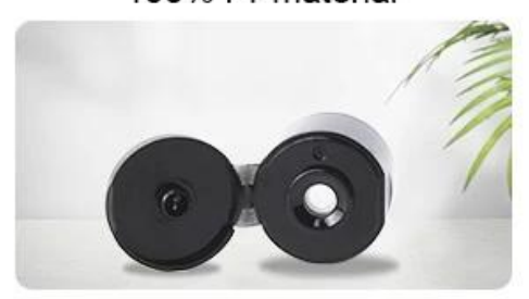
100% Improve brand expanding