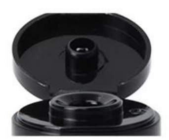
100% No leaking