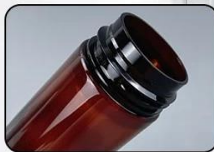
Smooth Bottle Mouth