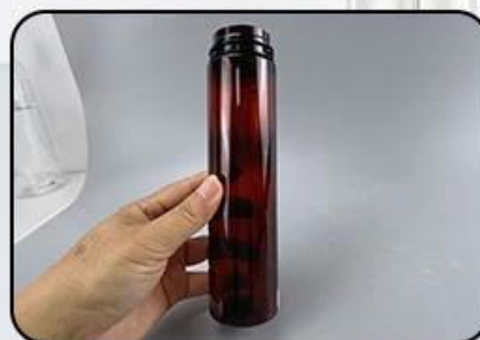
Visual High Transparent Bottle Body