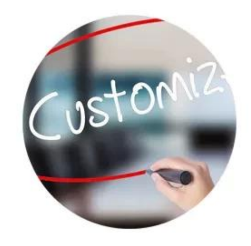
OEM with Factory price We can print LOGO, custom color to meet your personalized needs.