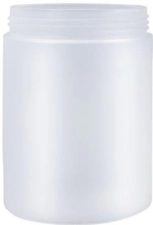
Environmentally Friendly PP Bottles