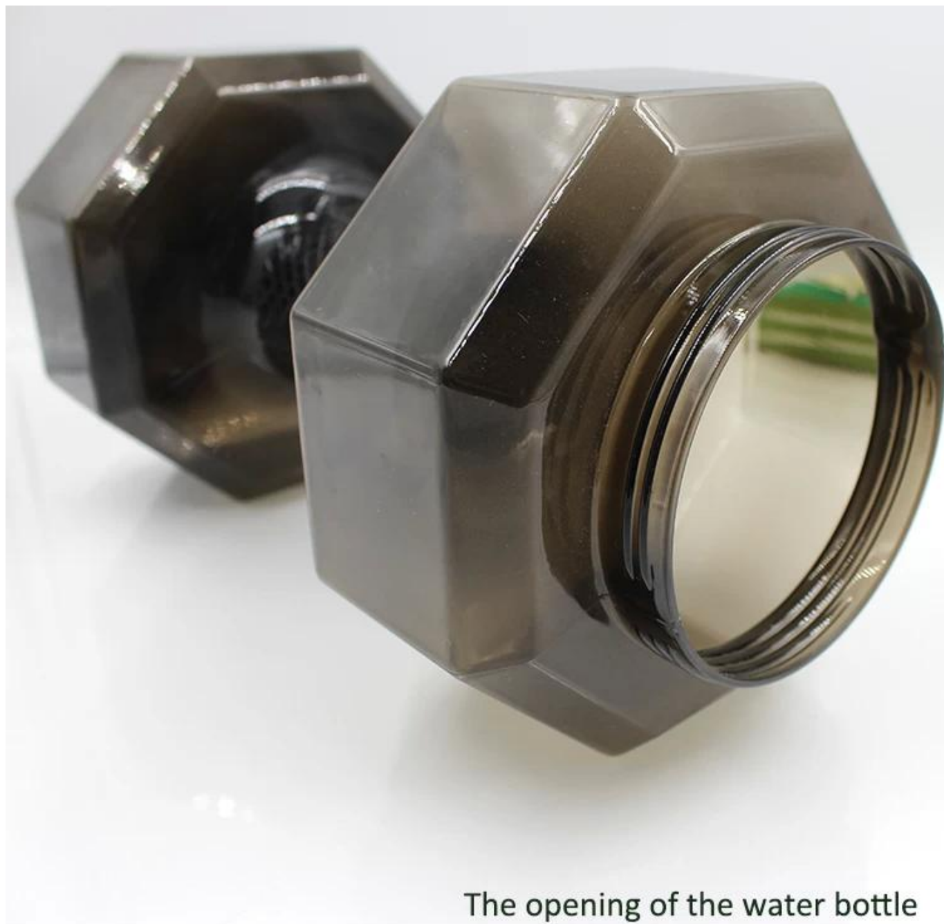
The opening of the water bottle