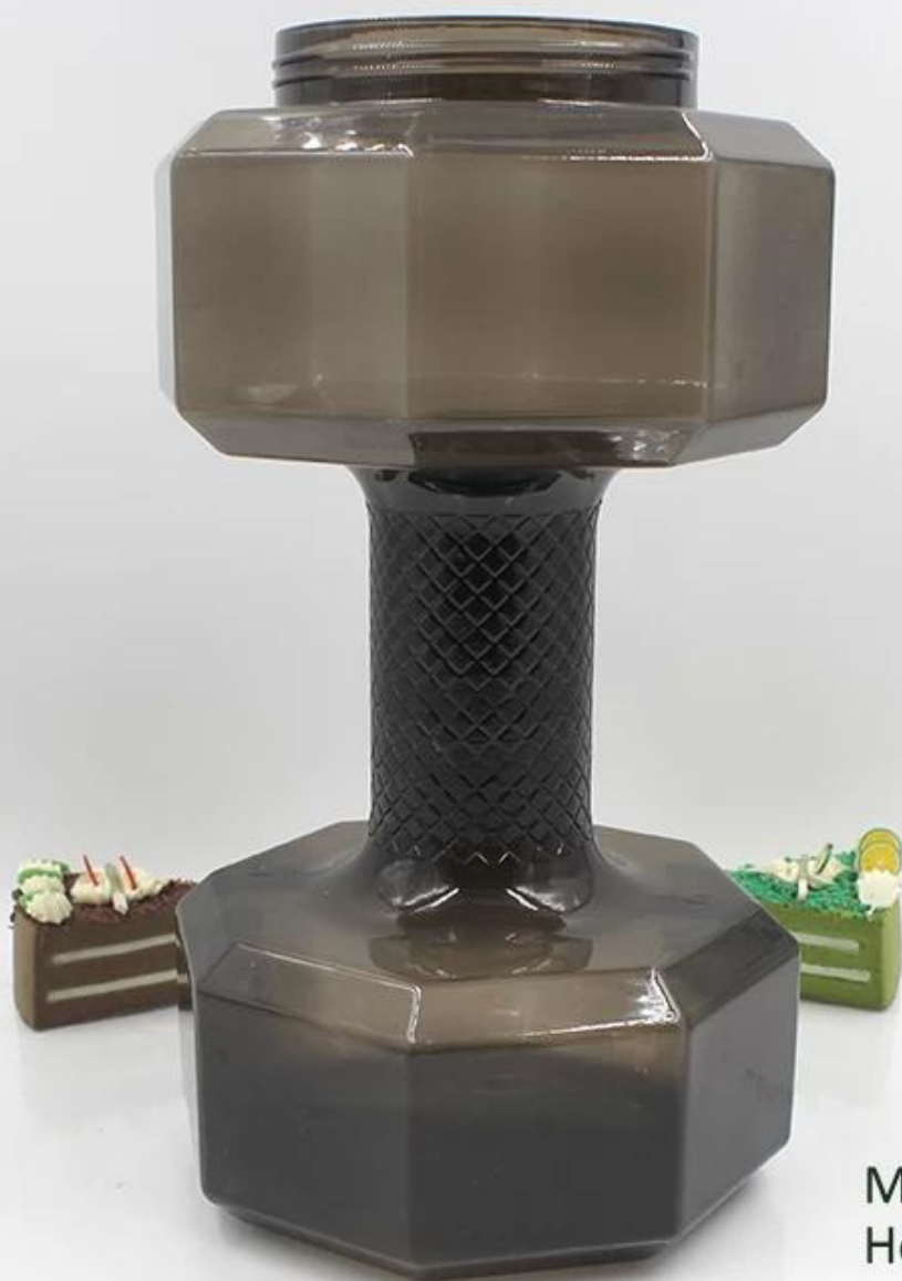
Material: PETG Height: 266mm