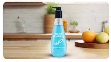
100% Improve brand expanding