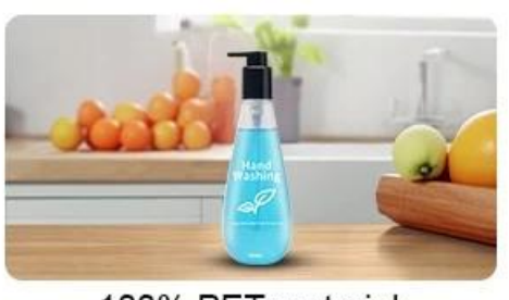
100% PET material