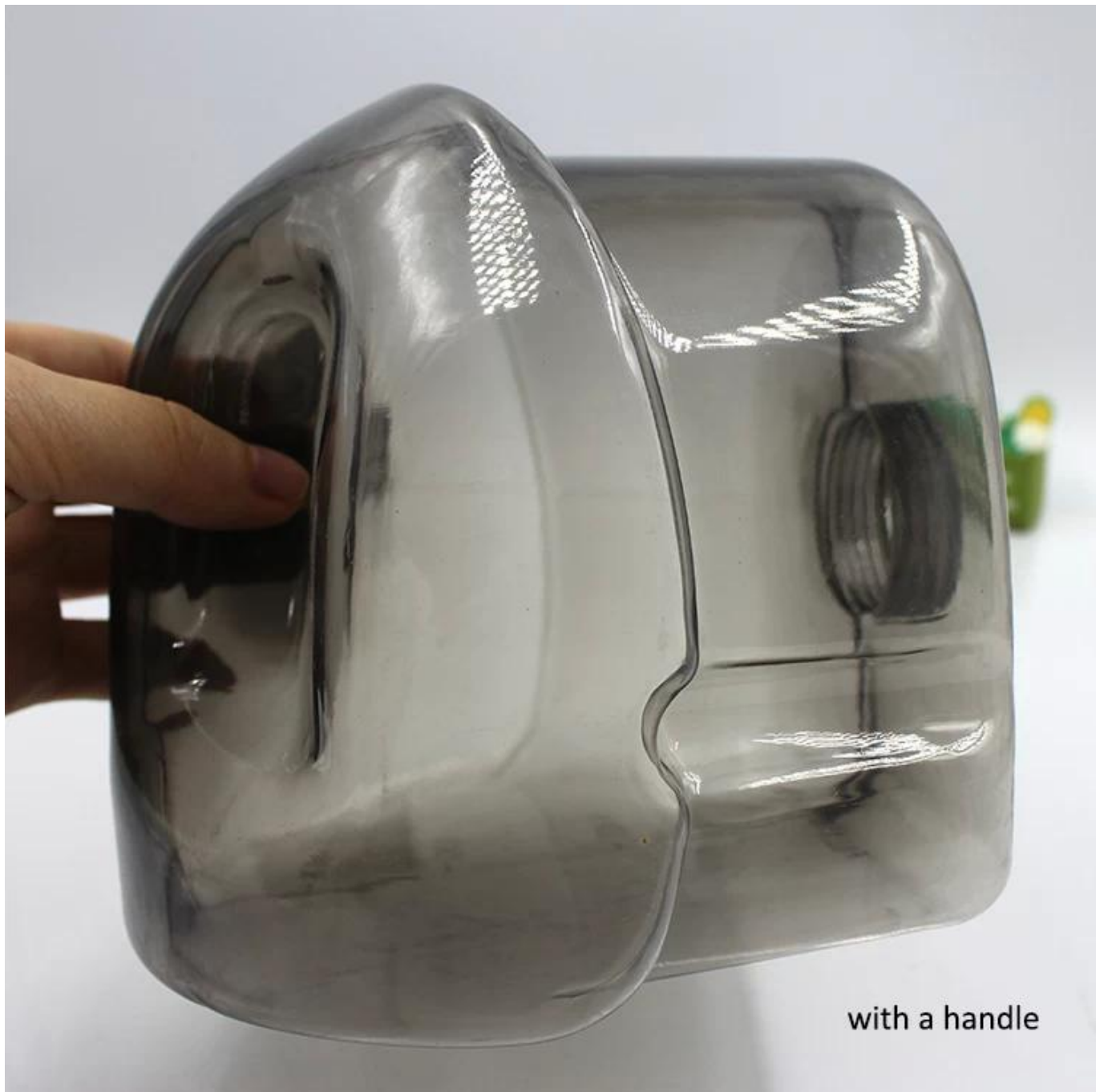
with a handle