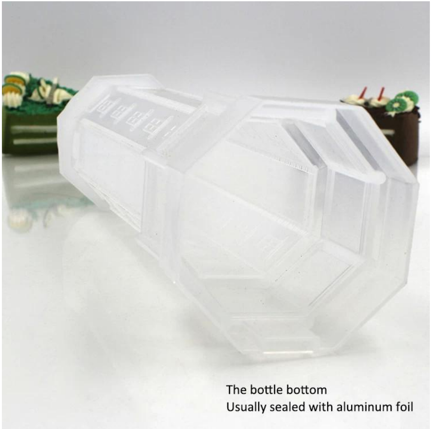
The bottle bottom Usually sealed with aluminum foil