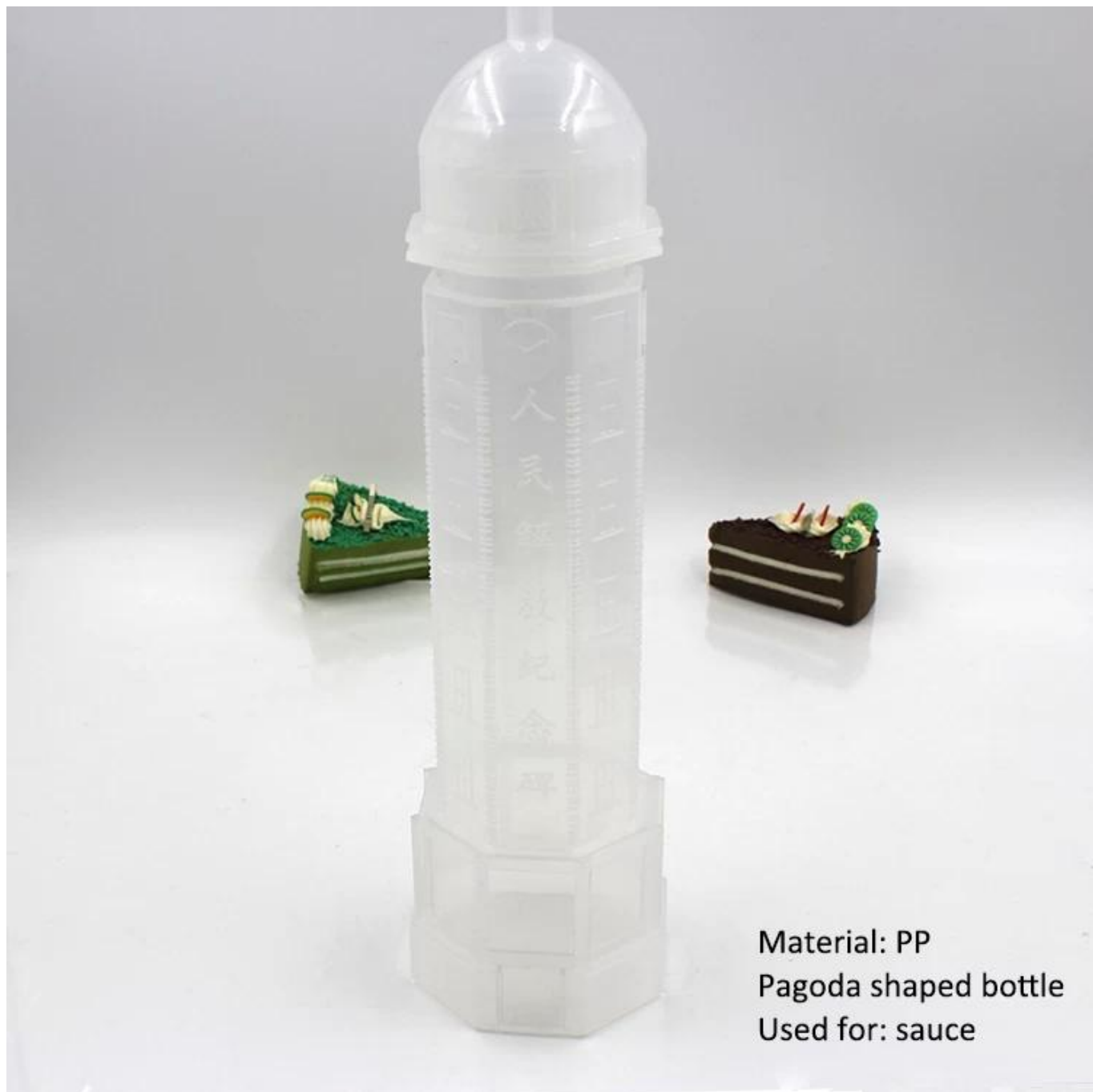
Material: PP Pagoda shaped bottle Used for: sauce