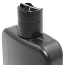
Flip top cap